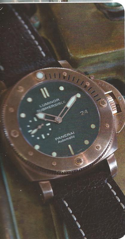
AM 382 "Bronzo"